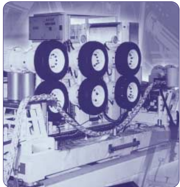
VSDs sending constant information of their torque status via CC-link

The need for finer control over tension has resulted in Fraser's move to a new generation of machines that use a PLC system as